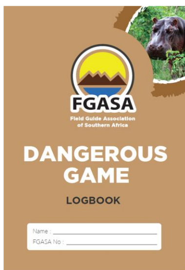
Dangerous Game Logbook

All dangerous animal encounters (Refer to the FGASA definition of an encounter ) as a Participant Trails Guide, an Apprentice Trails Guide, 1 st Rifle etc. must be recorded in the FGASA Dangerous Game Logbook.